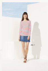
MARINE WOMEN 01403