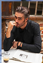
NEOBLU BLAISE MEN 03182