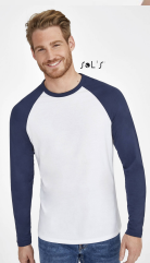
FUNKY LSL 02942