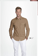
BURMA MEN 02763