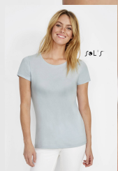
MARTIN WOMEN 02856