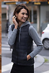
NEOBLU ARTHUR WOMEN 03173