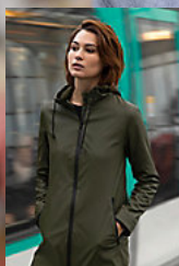
NEOBLU ANTOINE WOMEN 03175