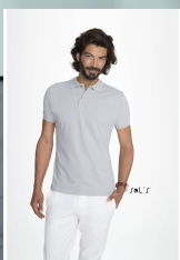
PERFECT MEN 11346