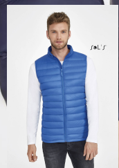
WILSON BW MEN 02889