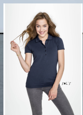
PHOENIX WOMEN 01709